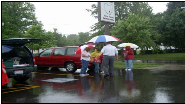
Jackson County Distribution Site

The distributions were held in each county. Gallia County was held at the Gallia County Fair Grounds on Saturday May 8, 2004 from 10 am to noon. The Jackson County distribution was held Saturday, May 18, 2004 10:00 am to noon at the Jackson County One-Stop. The Vinton County distribution was held Saturday, May 22, 2004 from 10:00 am to noon at the McArthur Supervalu Store parking lot. The project served over 300 families in the three county area with over 300 units of sundries being distributed. The community members that took part in receiving the sundries thanked the team and BHCC for hosting the project.