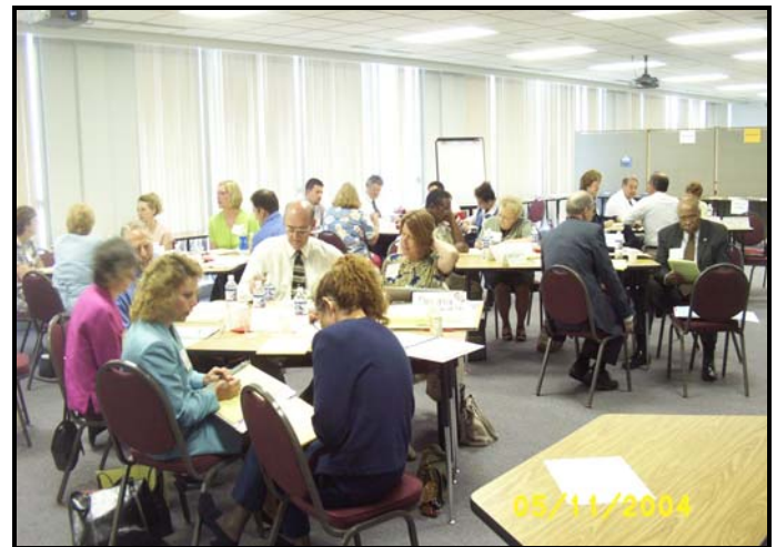
The State ABLE Team Hard at Work!

The Annual Spring Institute 2004 panelist discussion and workshop materials will be posted on the "For the Common Good" Project's web site in the near future. The web site URL is http://literacy.kent.edu/CommonGood/index.html .