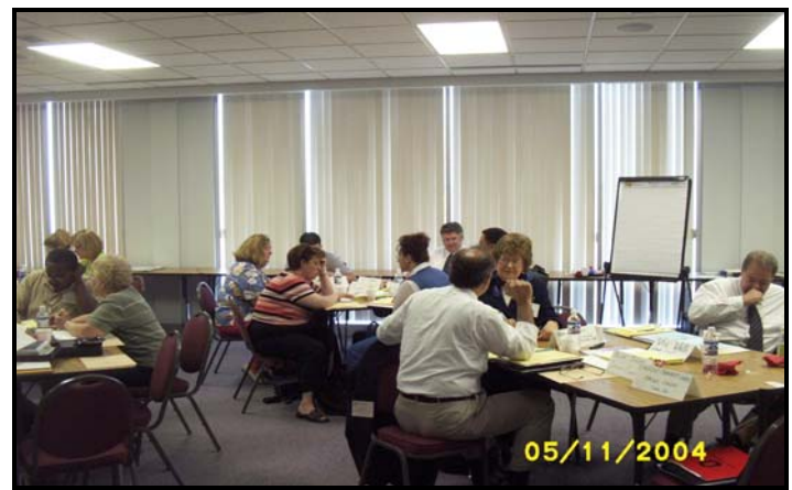
Appreciative Inquiry in Action!