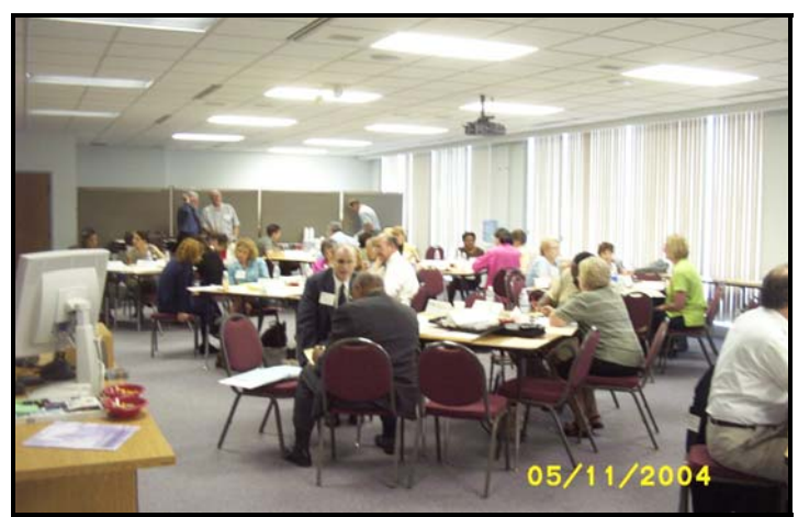
Institute Participants Networking!