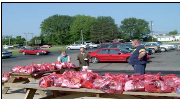
Vinton County Distribution Site