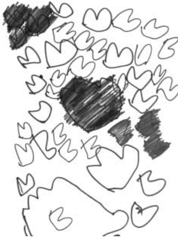
Artwork created by Eddie Soich